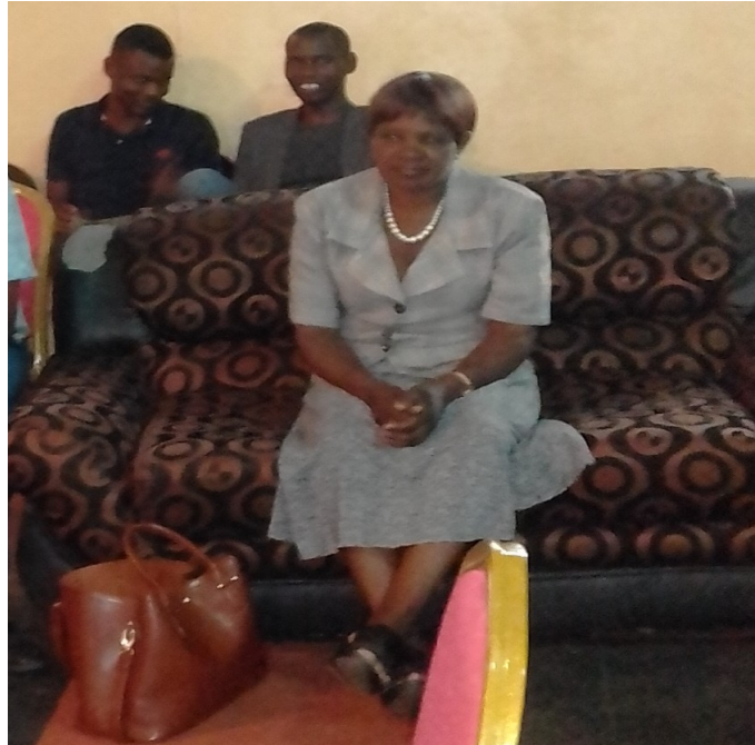
THE ZAMBEZI DAO

The DC further underscored the importance of developing literacy in communities. “The importance of having a literate citizenry cannot be over – emphasized. Therefore, it is very encouraging to government to note that there are individuals in our communities who are willing to put up such initiatives. This magazine will encourage our children to read, to research, to debate, to spell, and to write. Through these activities, illiteracy will surely reduce in the district and the province. It is, hence, imperative that such ventures are supported by all of us,” he stated.