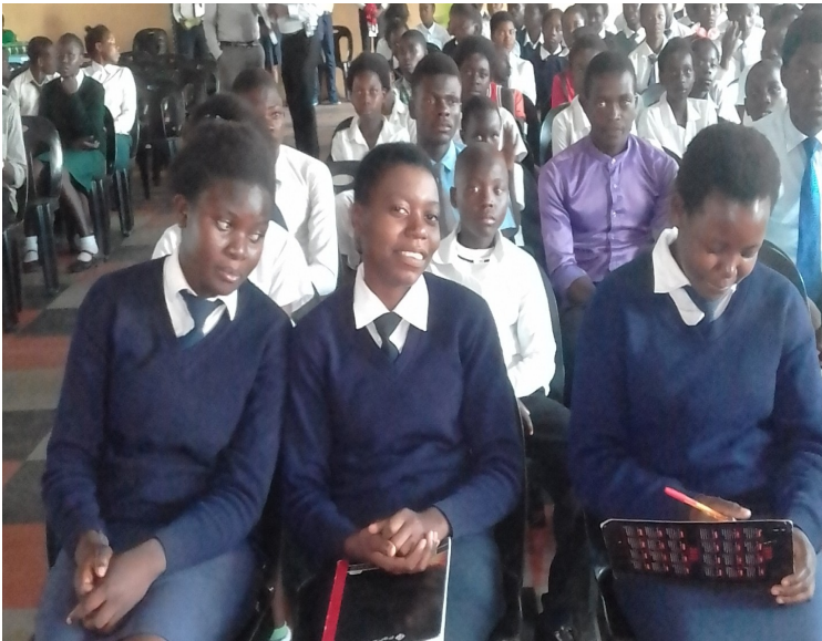
Pupils attending a ZWC event

illiteracy levels among the learners. This will be done by engaging learners in writing competitions and other literacy activities. Therefore, we believe that this project will encourage learners to read and write as some topics selected for the writing competitions will require learners to research widely. This process will help learners to develop their reading and writing skills.