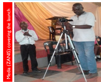
Media (ZANIS) covering the launch