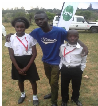
Winners of the Spelling bee competition with their teacher