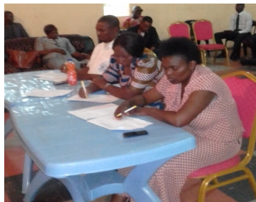
Judges for debate at the launch