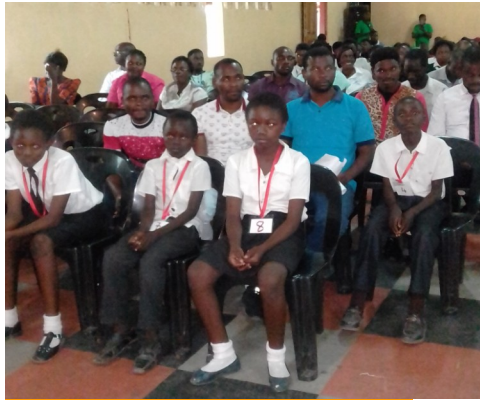
A portion of the audience at the launch