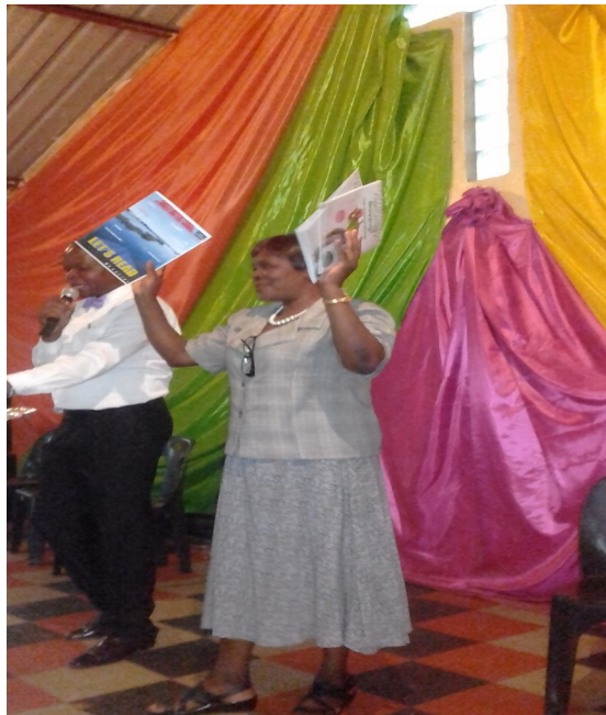
The Zambezi DAO launching LETS READ Magazine

The event included a host of educative entertainment activities of which the highlight was the debate and spelling bee competition. The interesting debate was between Zambezi Boarding Secondary School and Zambezi Day Secondary School, and the captivating spelling bee competition included pupils from various primary schools in the district. The debate was ultimately won by the Zambezi Day Secondary School Debate Team which scored 110 points to beat the Zambezi Boarding Secondary School Debate Team which scored 104 points. The spelling bee competition was very captivating as the primary school pupils showed their capabilities to spell different words.