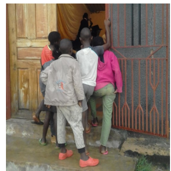
Those who couldn't find space inside but didn't want to miss the event