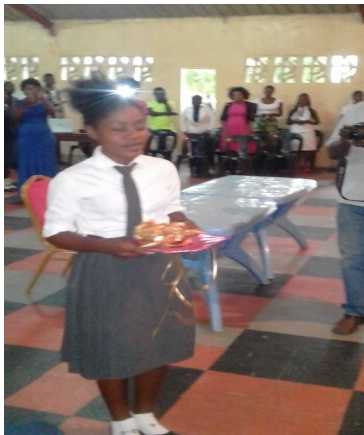
A pupil brings the magazine for launching