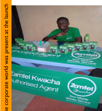
The corporate world was present at the launch