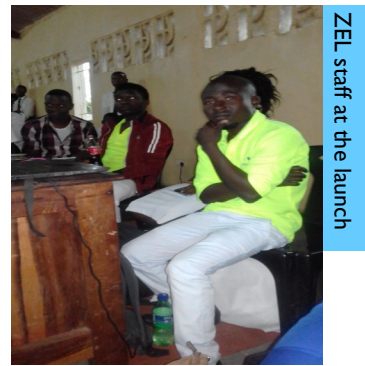
ZEL staff at the launch