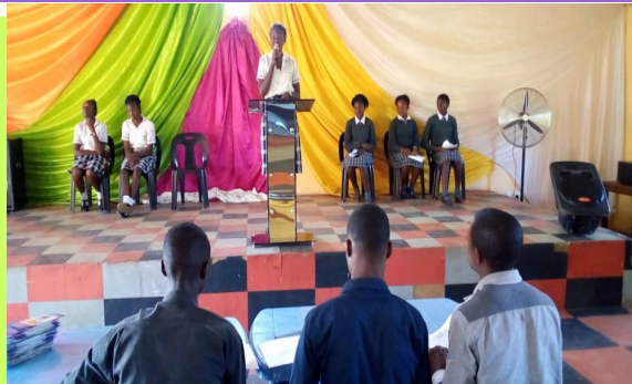
Debate session in progress at the Literacy Fair

Another activity that took centre stage at the Literacy was Poetry Recitation. It was so fascinating that the audience went jubilating. The poetry category had a lot of schools for both primary and secondary schools.