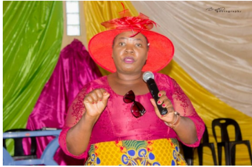
SEPA CEO giving a speech