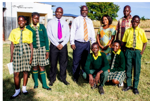
Chizozu pupils pose with the DEBS and DESO