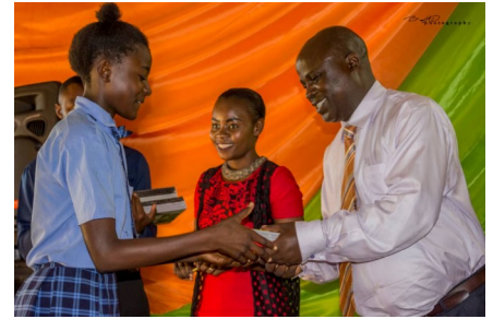
A winner gets her award