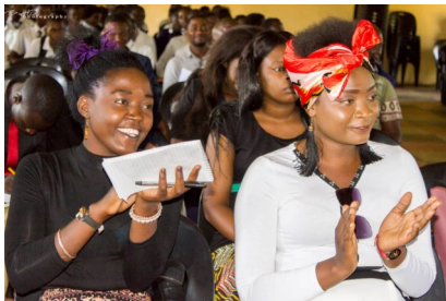
The audience enjoying the activities