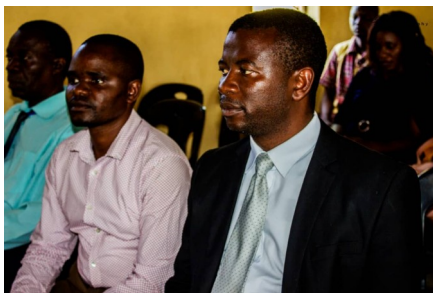
DACA Zambezi at the Fair