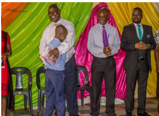
DEBS Zambezi gets a hug from a pupil