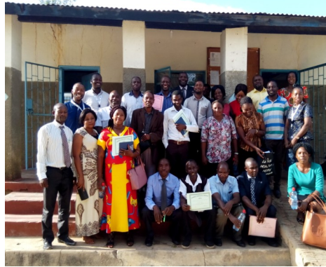
Participants at the Zambezi Training with their Certificates

cates of Attendance were issued to the participants. The Solwezi training was held with the support of Kansanshi Mining Plc through their