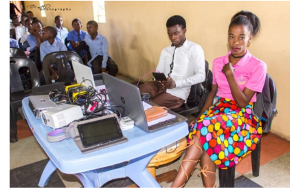
ZEL staff at the Fair