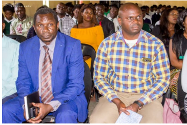
Part of the audience at the Fair