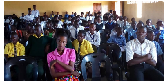
Part of the audience at the Fair