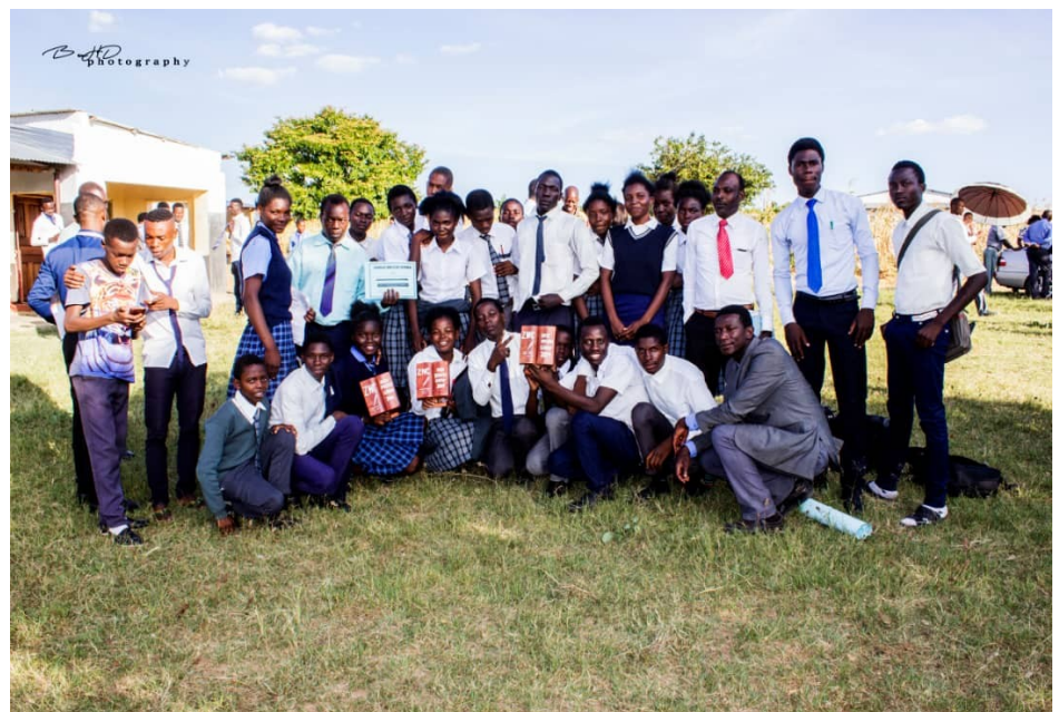
One of the schools that participated in the Literacy Fair