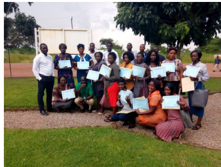
Solwezi participants with their certificates